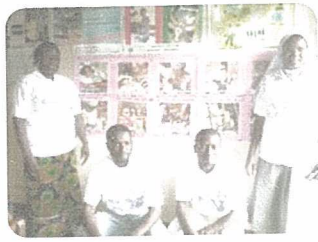
UNICEF contributed to the Day of the African child with posters at the back ground